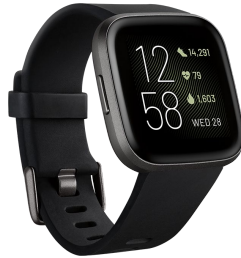
Versa 2 $199.95