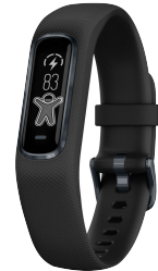
Vivosmart 4 $129.99