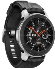
Galaxy Watch $279.99 - $329.99