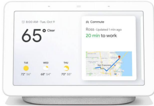
Nest Hub / Nest Hub Max