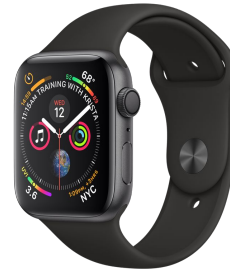
Watch Series 4 $349 - $379