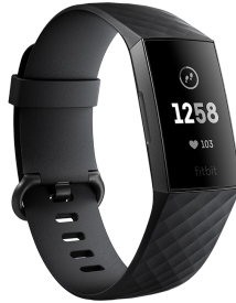
Charge 3 $119.95 - $139.95