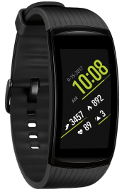
Gear Fit2 Pro $199.99