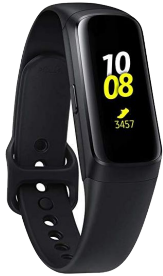
Galaxy Fit $99.99