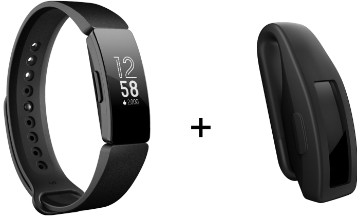
Inspire + Clip