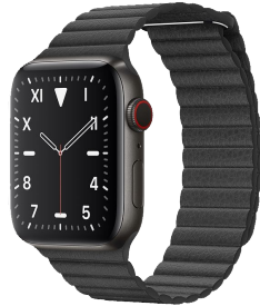
Watch Series 5 $399 - $429