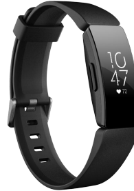
Inspire HR $99.95