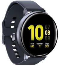
Galaxy Watch Active 2 $279.99 - $299.99