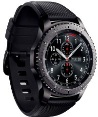
Gear S3 Frontier $249.99 - $299.99