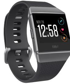
Ionic $199.95 - $249.95